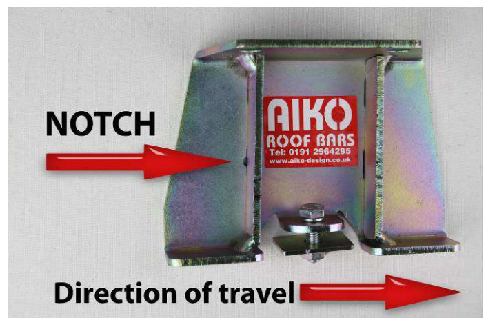
Rear driver side